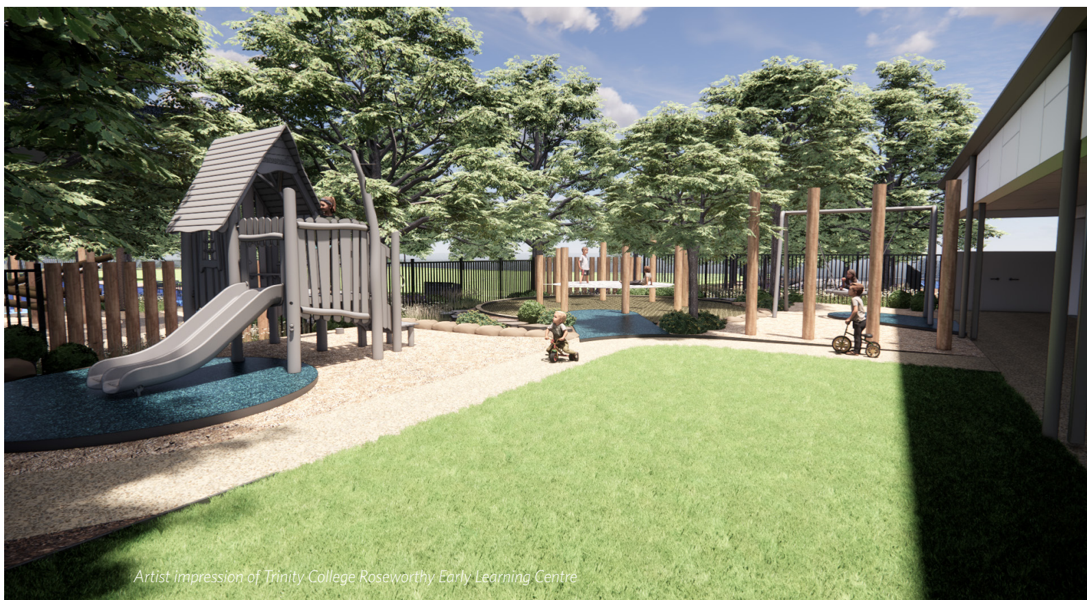
Artist impression of Trinity College Roseworthy Early Learning Centre

Catering for children aged between 3 and 5 years of age Opening Term 1 - 2024