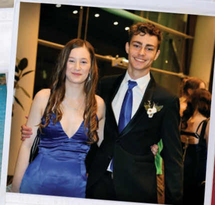
Year 12 Formal