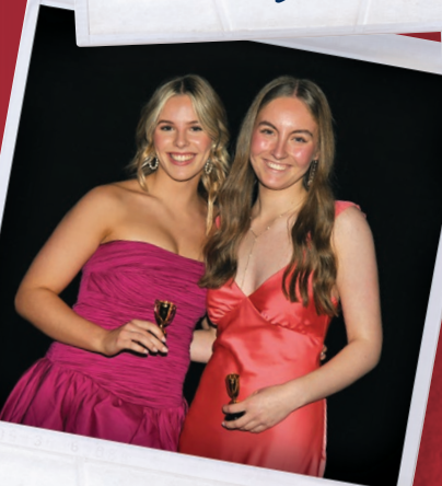
Year 12 Formal