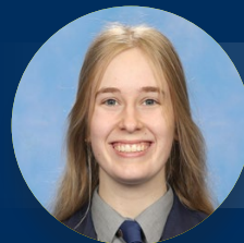
Katie Jenkin VET Foundation Community Achievement Award