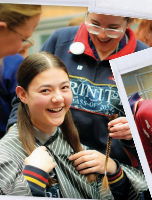
Shave for a Cure