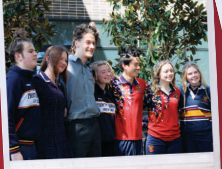
Shave for a Cure