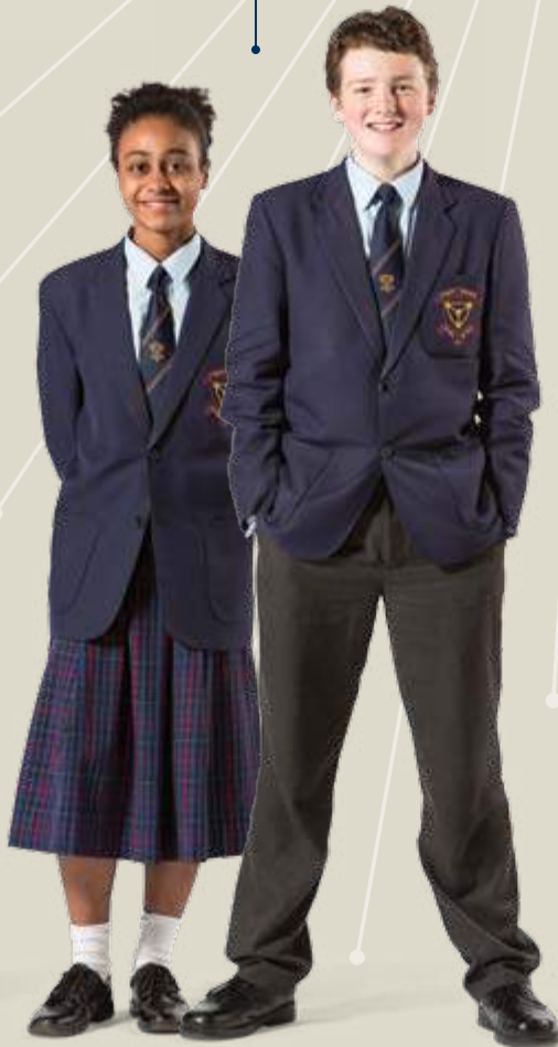
Middle School Years 7-10