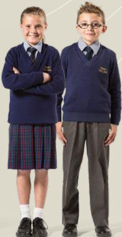
Junior School Reception-Year 6