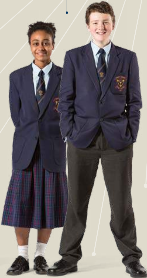
Middle School Years 7-10