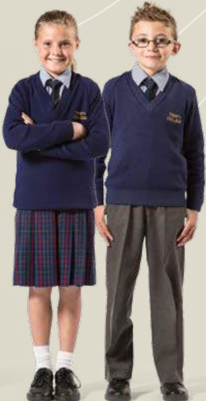
Junior School Reception-Year 6