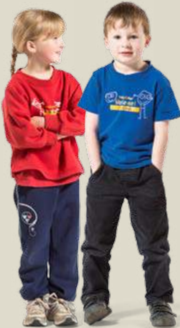
Montessori Preschool 3-4 year olds