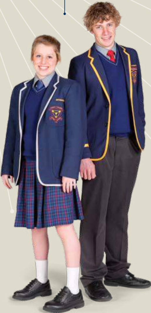
Senior School Years 11 and 12