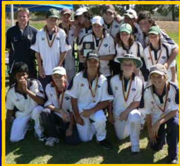
Year 8/9 Boys Pool B Metro North Winners Windsor Gardens Voc Coll