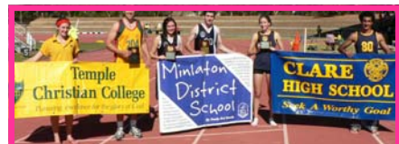
D Grade Winners