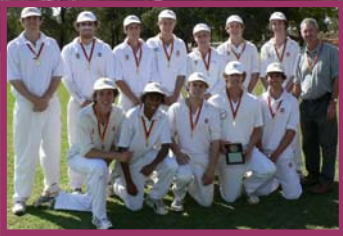
Open Boys Winners Prince Alfred College