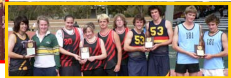
E Grade Winners