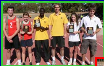
C Grade Winners