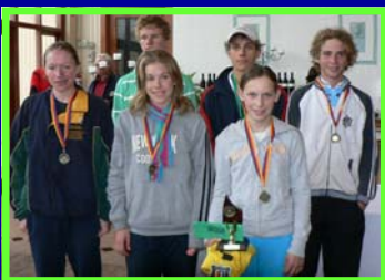
Age Group Winners