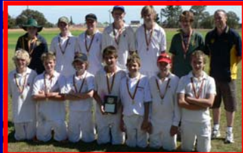
Year 8/9 Boys Pool B Metro South Winners St Francis de Sales Coll