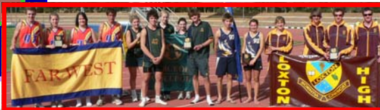
A Grade Winners