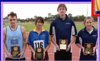
F Grade Winners