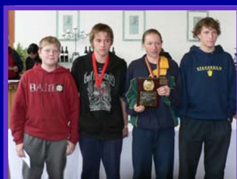
Brighton HS, Schools Team Trophy Winners