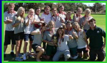
Open Girls Winners Henley High School