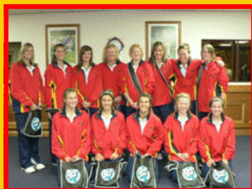
Interstate Netball team at the Welcome Dinner of the International Netball.