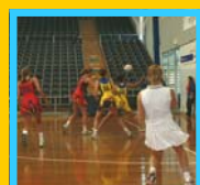
Action shots from the International Netball