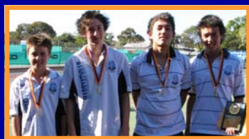
Open Boys Tennis Winners