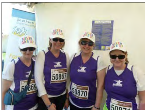
The lovely STARstore ladies complete 6km walk with never give up motto matching caps available from the STARstore.